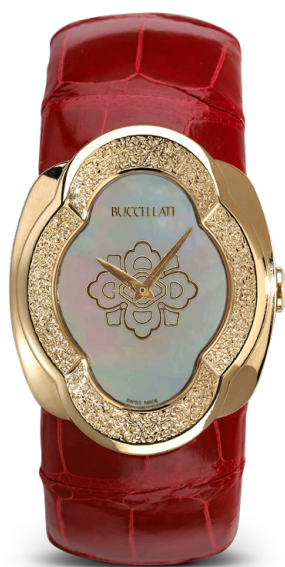
OPERA YELLOW GOLD CASE: "GRAFFITO" ENGRAVING SIZE: 28MM X 36MM