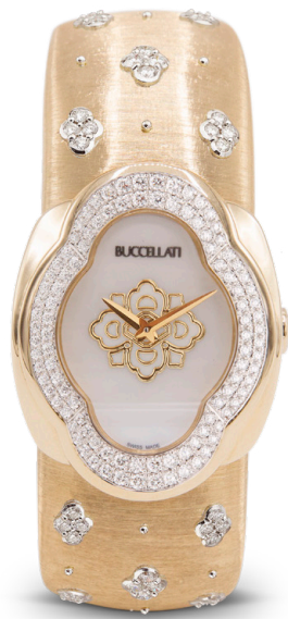
OPERA AB YELLOW GOLD AND DIAMONDS CASE: "GRAFFITO" ENGRAVING - BRACELET: "RIGATO" ENGRAVING, SIZE: 28MM X 36MM