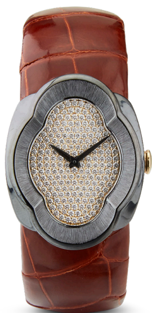
OPERA WATCH - DLC GOLD "RIGATO" ENGRAVING SIZE: 28MM X 36MM