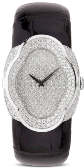
OPERA WHITE GOLD DIAMOND CASE & DIAL SIZE: 28MM X 36MM