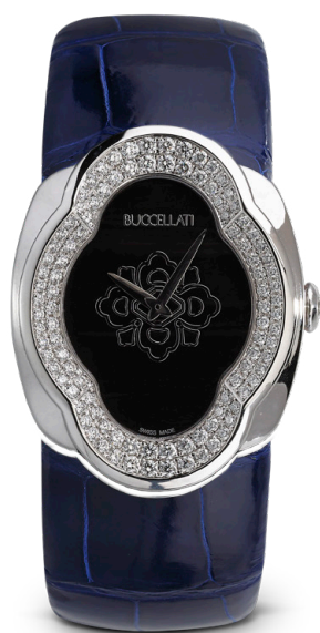
OPERA WHITE GOLD DIAMOND CASE SIZE: 28MM X 36MM