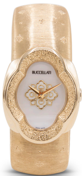
OPERA YELLOW GOLD CASE: "GRAFFITO" ENGRAVING - BRACELET: "RIGATO" ENGRAVING SIZE: 28MM X 36MM